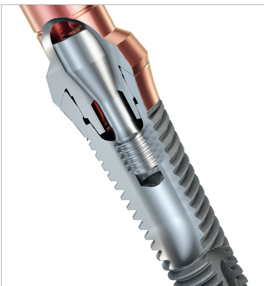
TRI Friction for a secure connection.