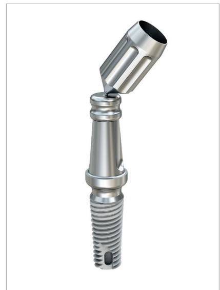
TRI 2in1 Impression Abutment.