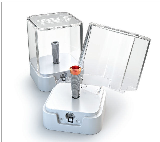
TRI Pod – ultimate simplicity.

The TRI Raptor Abutment range is the newest line of low profile direct implant overdenture attachments. With a low vertical profile of 2.1 mm and diameter of 4.4 mm, it is one of the smallest attachment systems on the market. This system offers multiple solutions for overdenture treatment planning in case of vertical space limitations.