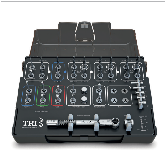
TRI Surgical Kit – next generation surgical kit.