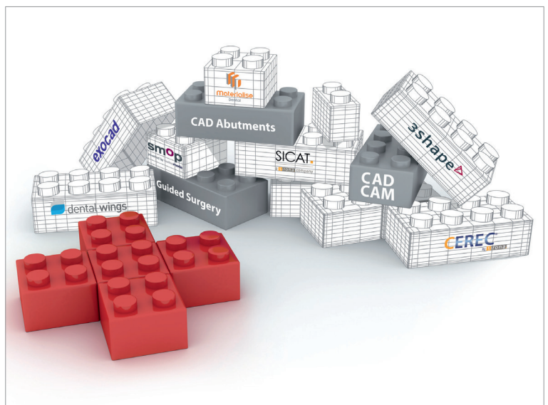
TRI Digital – interface to the digital world.